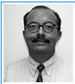
J. Edwin Nieves, MD, DFAPA

It is 6:15 am, on the 7th Floor West Hospital MCV, the night nursing shift is ending, and incoming nursing day shift is rolling in. Medical students and interns rotating through the psychiatry service crowd the nurses' station. You can smell the fresh coffee and hear the night shift nurse dictating reports. Reading and re-reading records, blood work and other pertinent patient clinical information, both medical students and interns prepare to answer questions that are sure to come later in the morning. In about 30 minutes, residents will come in and ask, "Any new admissions, anything overnight?"