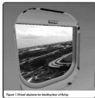
Figure 1. Virtual airplane for treating fear of flying