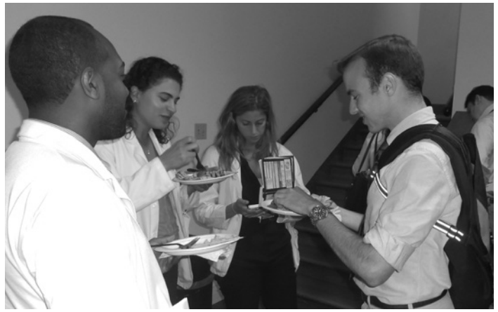
UVA residents enjoy some great snacks compliments of PSV prior to the Society updates.